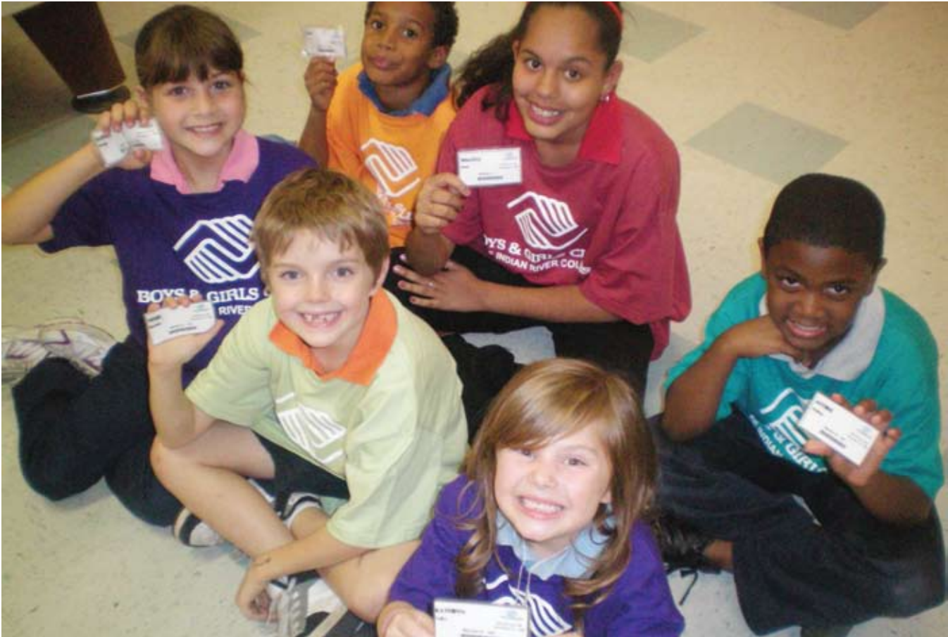
"I belong!" No wonder everyone is smiling as they hold up their Boys & Girls Clubs membership cards that identify them as being part of something special.