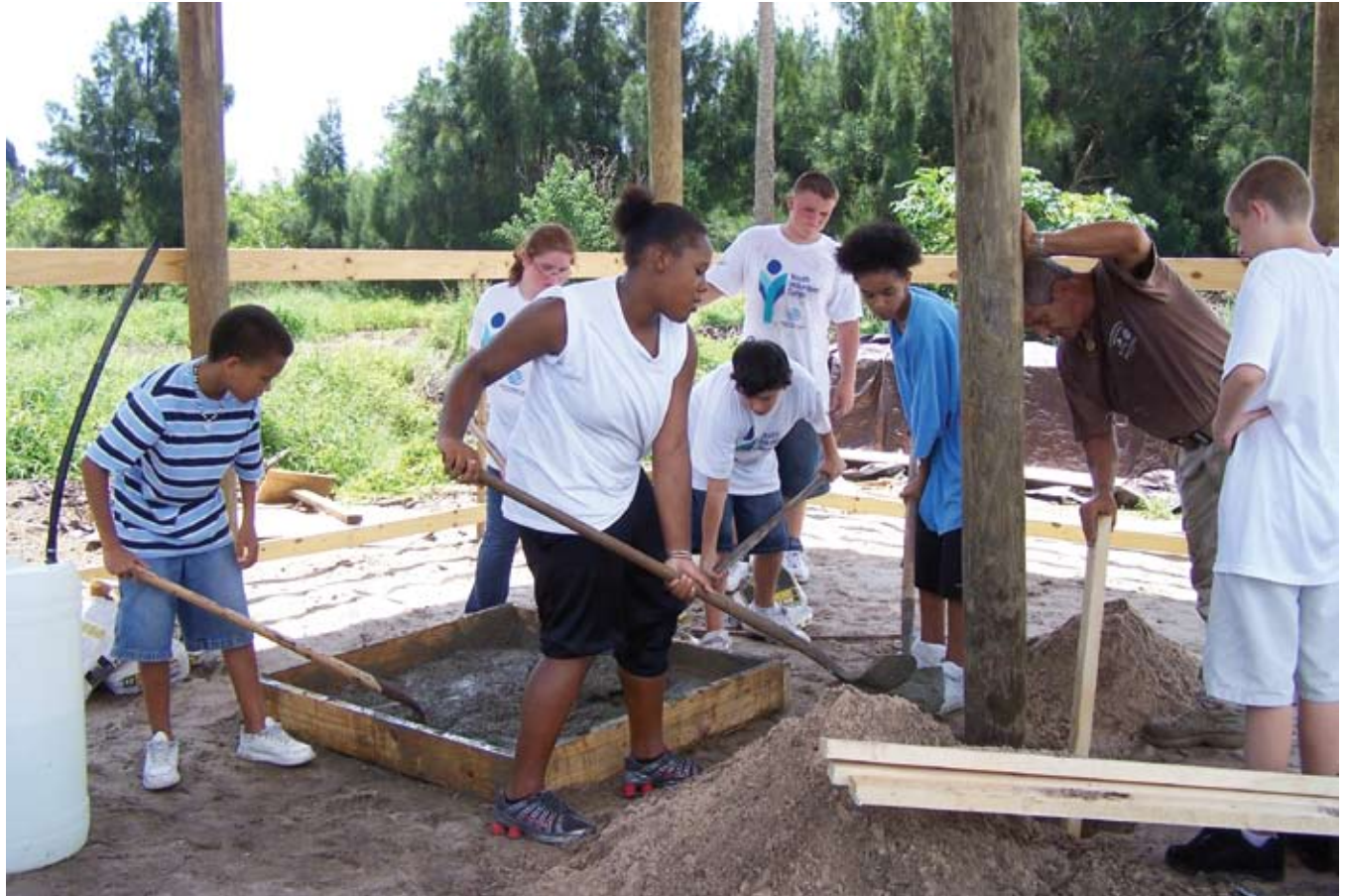
Club members rolled up their sleeves to help level the ground during a community service project. Volunteering is not only encouraged, it's enjoyed; last summer more than 40 Youth Volunteer Corps teens enthusiastically helped the Senior Resource Association deliver 1,200 Meals on Wheels to Gifford residents.