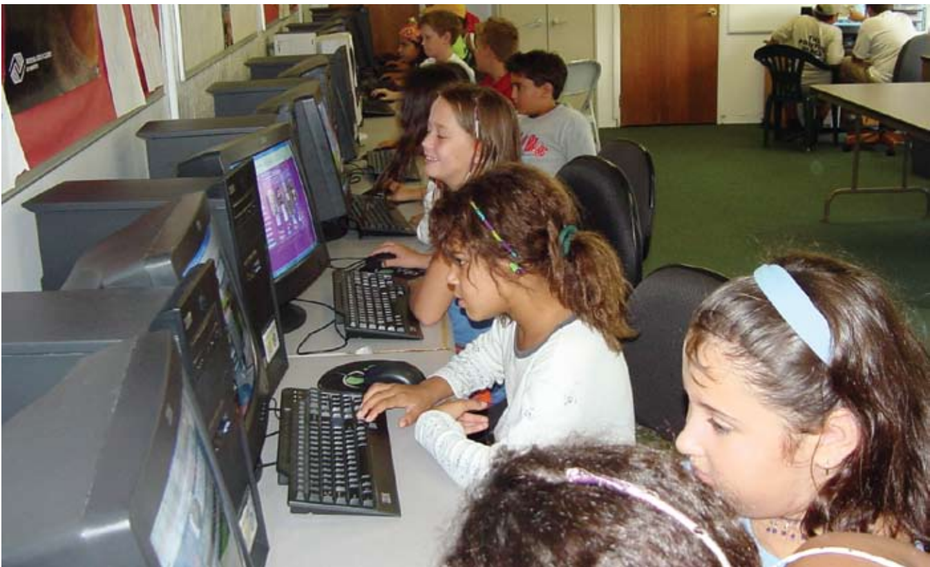
Computers are a part of life today, and club members, many of whom do not have access to one at home, are taught how to gather information and solve problems via a variety of programs.