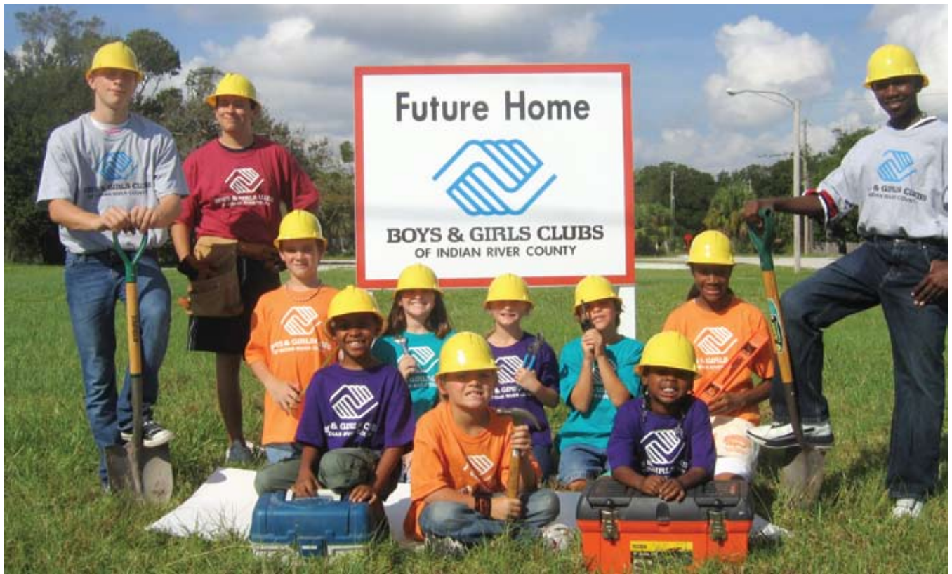
Members joined in the groundbreaking celebration for the new 30,000-square-foot clubhouse on 17th Avenue across from the Freshman Learning Center. Along with a new facility currently under construction in Fellsmere, the Sebastian clubhouse and Teen Center in Vero Beach, the Boys & Girls Clubs will soon be able to serve more than 3,000 children.